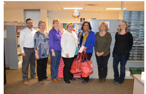
Queen's Finance Department - Clothing Donations