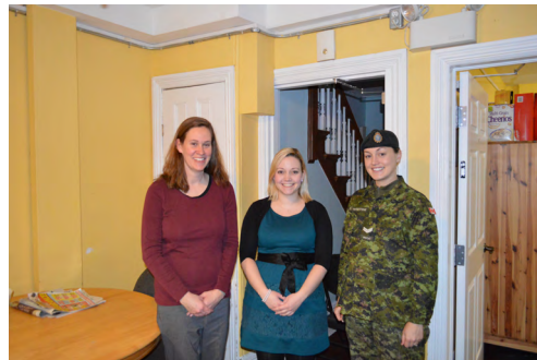
CFB Kingston - Donations to Ryandale Shelter